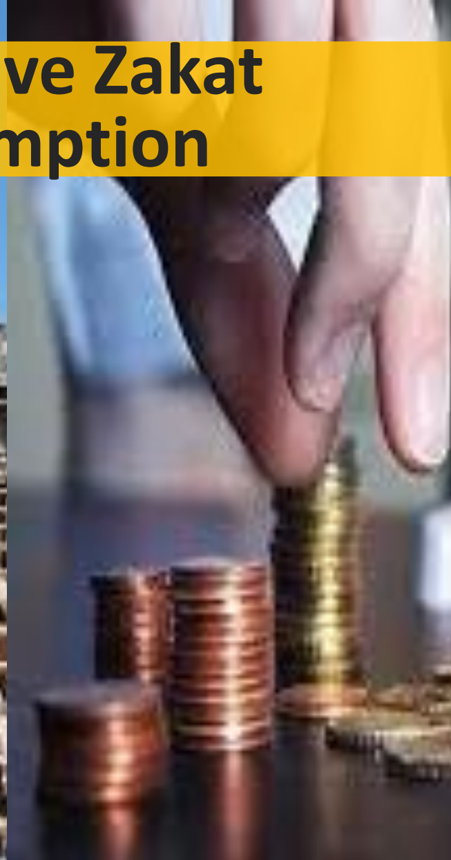
Help Business Capital