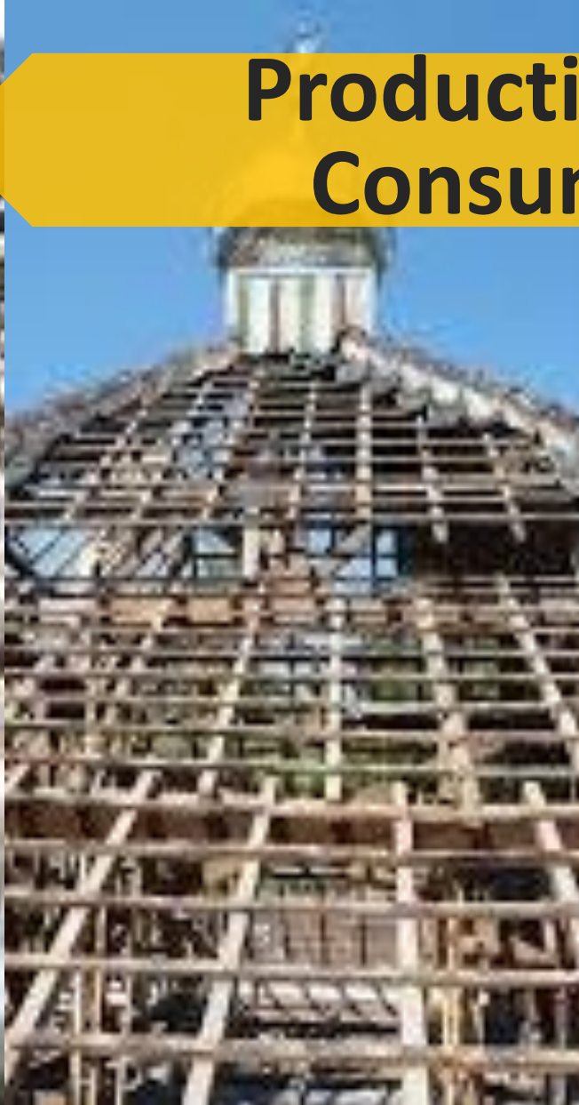
Construction of Places of Worship